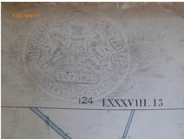
3. Embossed Cumberland First Edition 1862: