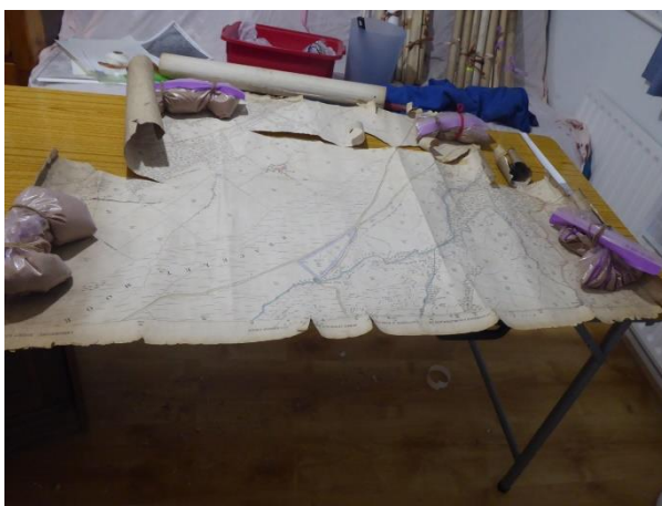
5. Some maps were very tattered and torn: