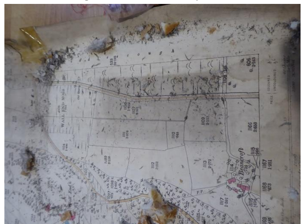
4. Cleaning with Tesco's cheapest white bread: