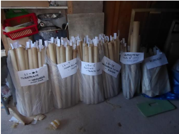
1. The maps: